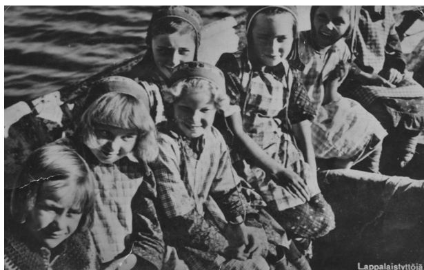
Figure 2. The postcard “Lapp girls” from 1930s.

In her “The Generations” series and in her Kadja-Nilla pictures in the 1990s combining landscape pictures with old archival photos, Helander