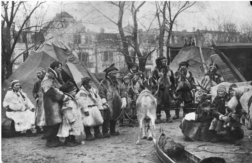
Figure 10. The Sámi traveled in Middle-Europe in “Lapp caravans” even in the year 1930, when they were photographed. They sold photographs, which also drifted to their home albums afterwards.

modern Sámi area. It is not only important to return items such as photographs, but also to reconstruct the knowledge around them: to re-identify the old encounters and stories. They are not only testimonies of past events or cultural encounters. When interpreted through the lenses of the Sámi subjects, the photographs tell multiple illustrated stories about “our histories” and the recent past of families, kinships and small Sámi communities.